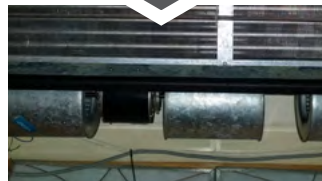
Clean Heat exchangers produce better performance and air quality.