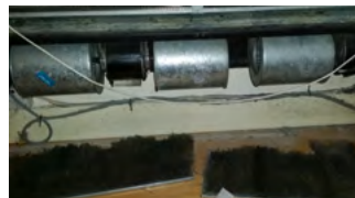
The surface of the chilled water heat exchanger gets damp during operation so it collects debris and mould.