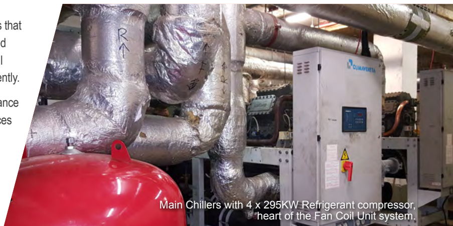
Main Chillers with 4 x 295KW Refrigerant compressor, heart of the Fan Coil Unit system.