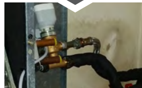
Upgraded/replaced valves and pipe insulation reduce risk of breakdown and condensation damage.