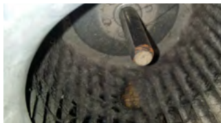
Dirty Fan Blades cause vibration and reduce the fan bearing lifetime.

Similarly, the regular servicing of the fan coil units has delivered major savings. Many of the eighteen year old fan coil units had internal parts that had stopped working. To replace all of the units would have cost Marathon House £1,000 per unit. Bonus Eventus has been able to reduce that cost by two thirds by servicing each of the units in the one hundred and five apartments and replacing worn out parts, at a cost of £330 +VAT per unit.