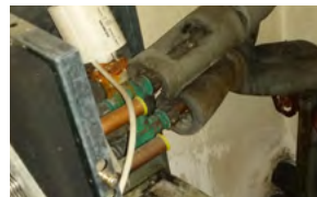
Aging chilled water actuators, valves and pipe insulation impact operation.